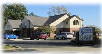
118 Cross Creek Boulevard, Salem