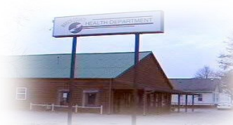
1013 North Poplar, Centralia